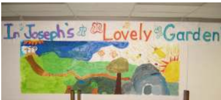
"In Joseph's Lovely Garden"

By: Cherub and Trinity Choirs Located in the stairway near the Education entrance.