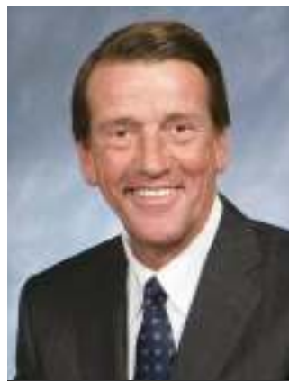
The Written Word

Afterward, he walked the farmer to his car, and as they passed the tree by the front door, the farmer asked him about what he had done