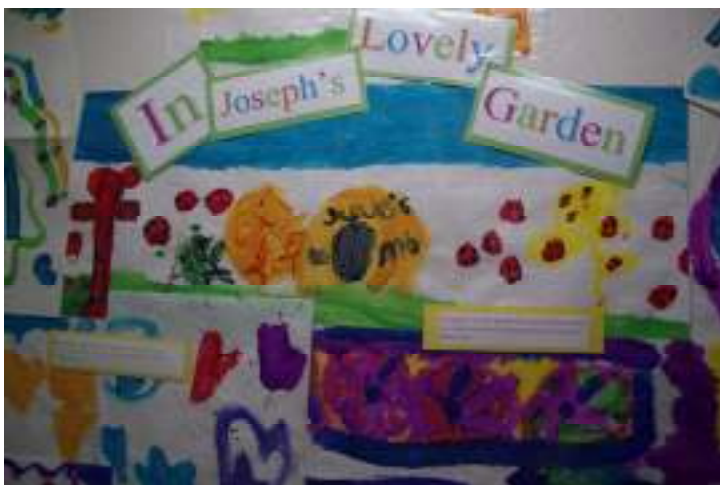
"In Joseph's Lovely Garden"

By: Cherub and Trinity Choirs Located in the stairway near the Education entrance.